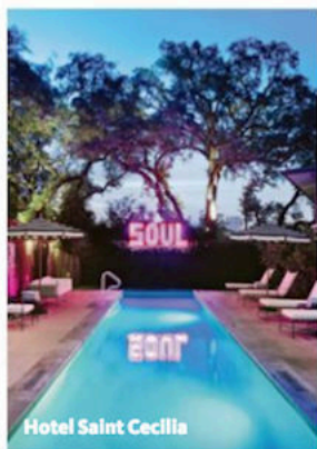
Hotel Saint Cecilia

STAY Book a posh poolside bungalow at Hotel Saint Cecilia , rest up in a retro-inspired room at Lone Star Court or take a load off at Native Experiential Hostel , a communal space that boasts bunk beds and a coffee bar for that necessary pre- or post-party caffeine kick.